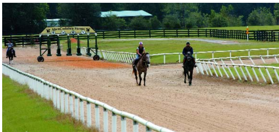
The training operation at AbraCadabra breaks 60-80 yearlings each fall